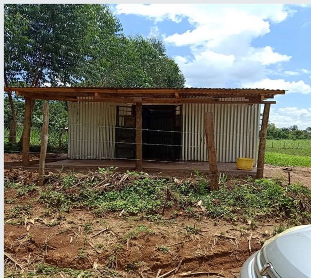
Temporary home for the Posho Mill